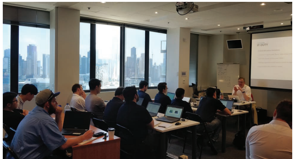
Austco Technical Training, January 2018, Melbourne Australia

We strive to provide our partners with the education and training they need to exceed their customer's expectations. Thank you to all who participated.